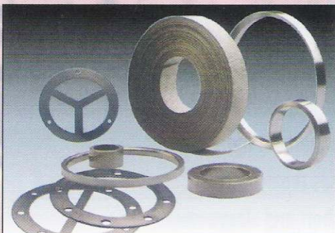
M-GRAF Graphite Tapes, Rings & Gaskets