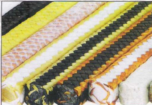
Braided Gland Packings